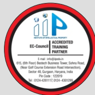
Institute of Intellectual Property