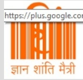
Mahatma Gandhi Antarrastriya Hindi Vishwavidyalaya, Wardha