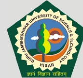
CBRI, Guru Jambheshwar University of Science & Technology, Hisar